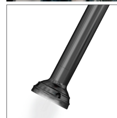
PEEK Material Steam Wand