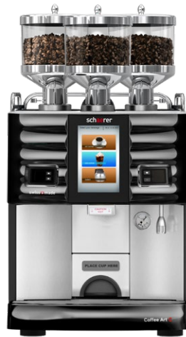
Coffee Art C HC Touch 3G Model #: 040381-00053EUS