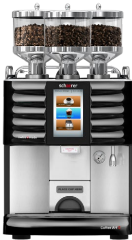
Coffee Art C HC Touch 3G Model #: 040381-00051EUS